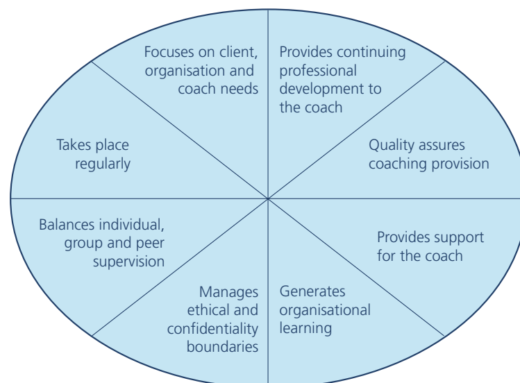
Figure 2: Coaching supervision: wheel of good practice